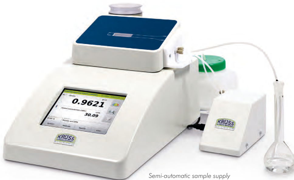
Semi-automatic sample supply with DS7800 via peristaltic pump DS7070