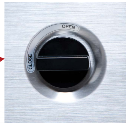
Drain Knob for 605/610/620