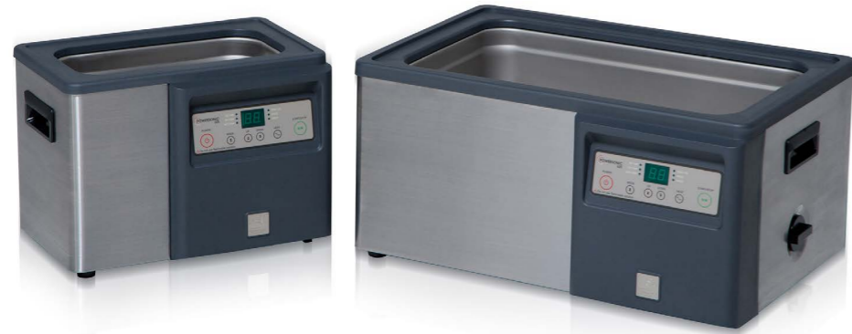
POWERSONIC 605/620 (5liter/20liter)