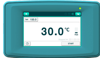
Excellent visibility with 5-inch large LCD