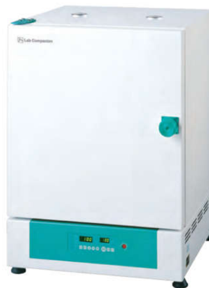
ON-11E with Wire Shelves 2ea (standard)