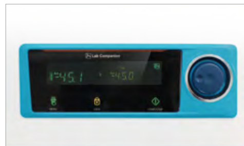
Intuitive checking of device operation information with large VFD