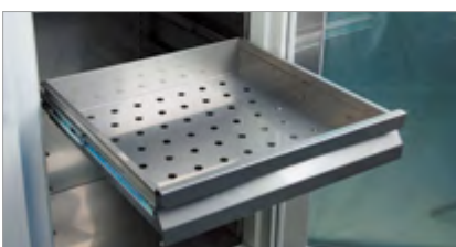
Solid steel drawer shelf. (option)

Provides a clean environment with a structure that does not form dew on the door and outer wall.