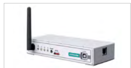
Mobile remote monitoring system. (option) (CLG3/PSR3 model)