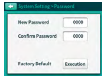
Digital door lock (CLG3 model)