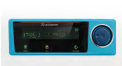
Intuitive checking of device operation information with large VFD.

※ Some of the above contents are limited to specific models.