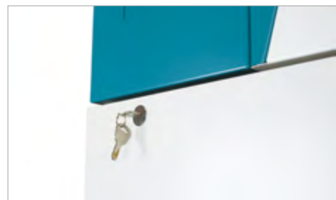
Door key lock