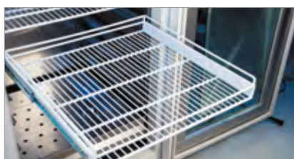
Drawer type of wire shelf with excellent permeability. (option)