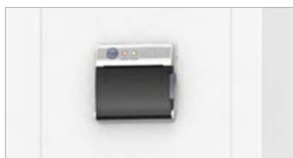
Storing samples in a stable through a real-time temperature recording. (Included as standard only for PSR3, for the other models are optional.)