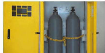
Plastic chain for fixing cylinders