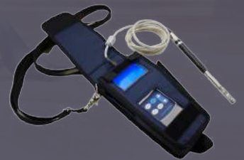
Hands-free Case now available!