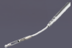
Telescopic, articulating probe