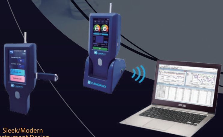
Sleek/Modern Instrument Design