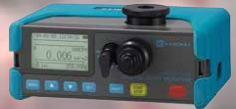
Model 3443 with rubber protector