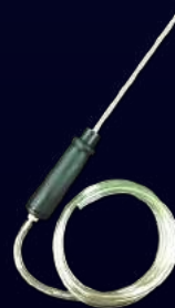
Sampling probe for hard-to-reach locations