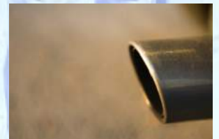
Engine Exhaust Testing