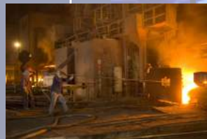
Checking worker exposure to airborne contaminants