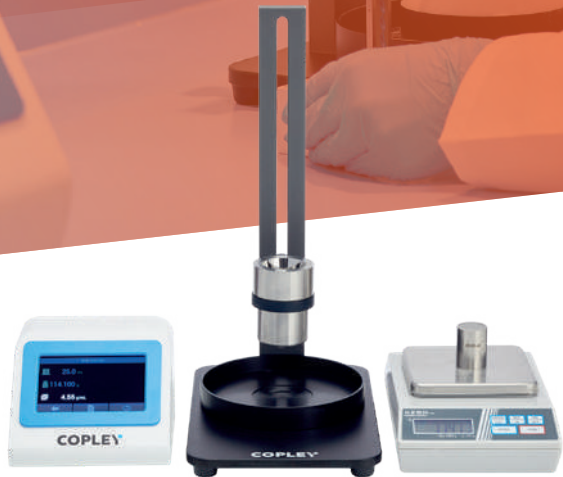
Kern Balance with PTW and PTA 100i