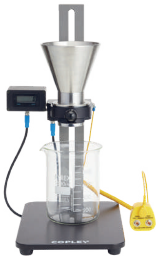
Anti-Static Grounding Kit