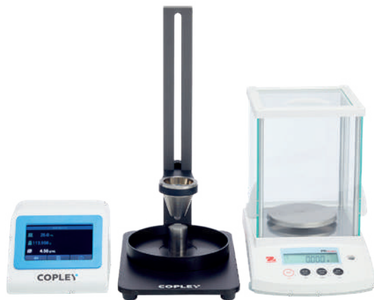
Ohaus Balance with PTW and PTA 100i