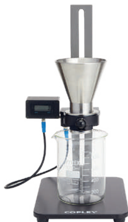
Timer for PTW